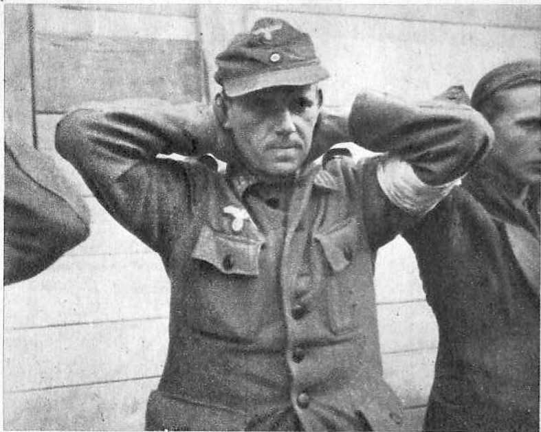
END of THE WEHRMACHT.

as the task force and 2d Battalion linked up. For the next two days as much of the regiment as trucks could be found for followed the advance of the 473d, which had exploited the breakthrough and was now driving on Genoa. Finally, on the 27th, the regiment was ordered to flank Genoa from the north, seize Busalla, and block the pass at Isola del Cantone to the north, so as to cut off the enemy's escape route to Turin. The 100th immediately moved out on this mission, occupying Busalla at 1000 hours of the 28th after an all night foot march, inasmuch as it was impossible to repair bridges in time to get trucks across. Late the same afternoon, the 3d entered Genoa, riding commandeered street cars. Elements of the 3d had also accepted the surrender of a thousand enemy in the hills directly to the southeast even as Genoa was being entered. The battalion then set up defensive positions to the north and west of the city, where it remained in occupation until the cessation of hostilities.