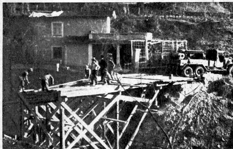
The COMBAT ENGINEERS worked long and hard to keep the supply net open.

Elements of the 100th Battalion swung toward the coastal sector to make contact with the 473d Infantry, but ran into strong enemy pockets that had been by-passed and a stiff fire-fight developed. Meanwhile, the remainder of the battalion assembled in Gragnana, from where B Company was sent to Castelpoggio to reinforce the 2d Battalion, which had launched an attack on Mount Pizzacuto.