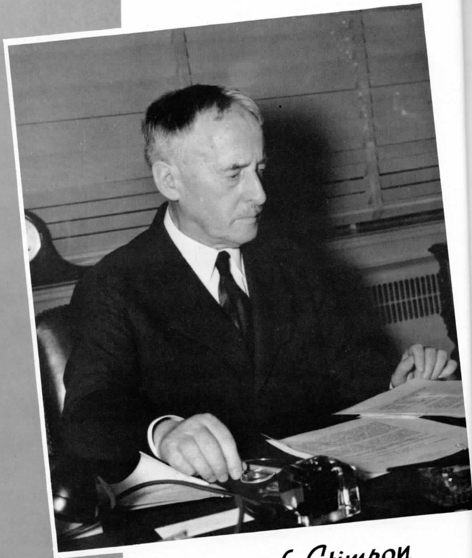
Henry L. Stimson SECRETARY OF WAR